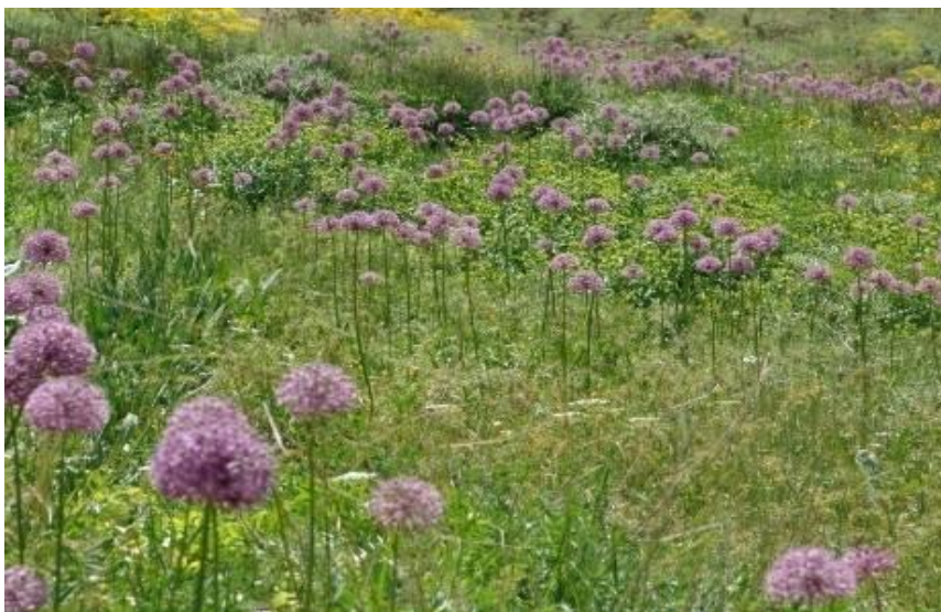
Fig. 2. Shallot species in Varnasa, Naghadeh rangelands (50 cm high in May 2015)

well as tuber are used in powdery form at food industries (Ebrahimi et al. , 2008). It also has medicinal properties such as antibacterial (Rahbar et al. , 2005), antimicrobial (Taran et al. , 2006; Ghahremani-majd et al. , 2012) and anti-tumor properties (Ghodrati Azadi et al. , 2008). Medicinal, edible and industrial properties of this plant have caused to be utilized severity and wastefully. On the other hand, this species is highly endangered due to the destruction of rangelands, overgrazing and pest infestations.