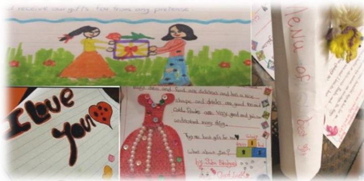
Figure A.1. Generated Data from Meaning Focused Group Compositions