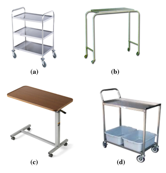
Fig. 1 Picture of some of the hospital meal carts common to Nigeria hospitals: a Three-layer hospital meal cart; b over bed table/meal cart; c over bed table/meal cart; d two-layer hospital meal cart

Statistics on pushing and pulling from Reporting of Injuries, Diseases and Dangerous Occurrences Regulations (RIDDOR) investigated by Health and Safety Executive (HSE) showed that the most frequently reported site of injury was the back (44 %), followed by the upper limbs (shoulder, arms, wrist and hand) accounting for 28.6 %, 12 % for accidents involving pulling than pushing, 61 % of accidents involving pushing and pulling objects that were not supported on wheels (bales, desks, etc.) and 35 % of pushing and pulling accidents involving objects (Health and Safety Executive 2013). Also Jung et al. (2005) revealed that the use of hospital meal carts was designed to ease the burden of manual material handling on workers, and it has been shown to be efficient because of less energy used per time. However, recent studies reported that these carts have caused suffering and injuries to workers and has increased the risk of musculoskeletal problems.