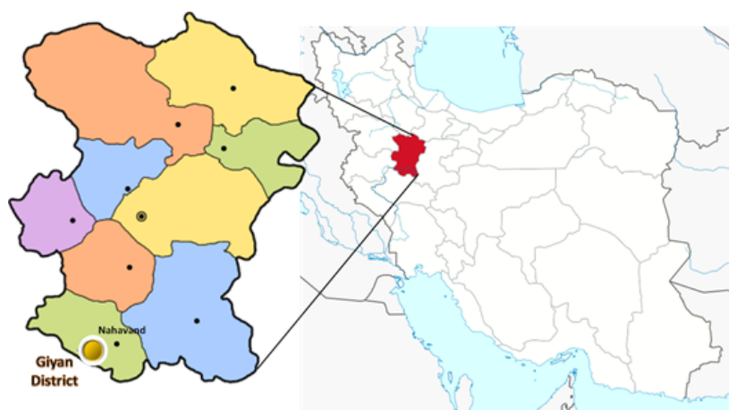
Figure 1. Location of the studied area on the map of Iran.

The research area is Giyan tourist district (Lat. 34°10'48"-34°10'16" N., Long. 48°14'32"-48°14'53" E.) in Nahavand County located in