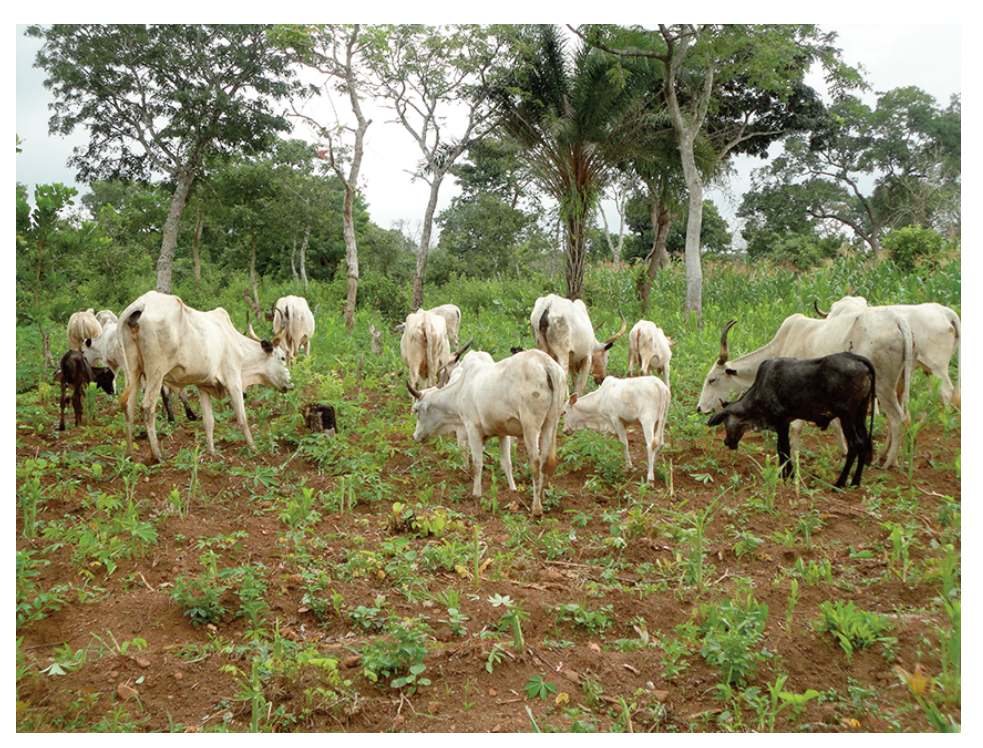
Figure 2: A herd of cattle eating a farmer's crops