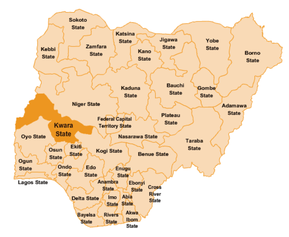
Figure 1: Map of Nigeria highlighting Kwara State

cultures. Among these tribes and culture are: Yoruba, Fulani, Hausa, Nupe, Bororo, Igbira, Baruba, and others. Figure 1 shows the map of Nigeria highlighting the study area.