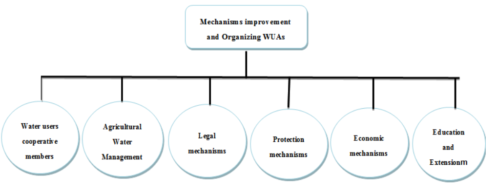
Figure 5: The hierarchy process tree to determine the criteria, sub and alternatives

Sub-criteria of WUA member's attitude improvement, are: establishing cooperatives to increase the farmers' income, create cooperative of water used, so that to distribute water in a fair way among farmers, with the membership of farmers in the cooperation, the management of irrigation water may be fulfilled in the appropriate way, etc. (Table 1) (Figure 5).