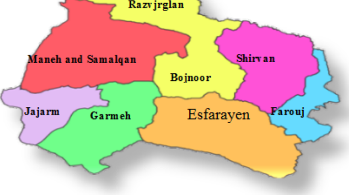
Figure 1: North Khorasan Province in Iran