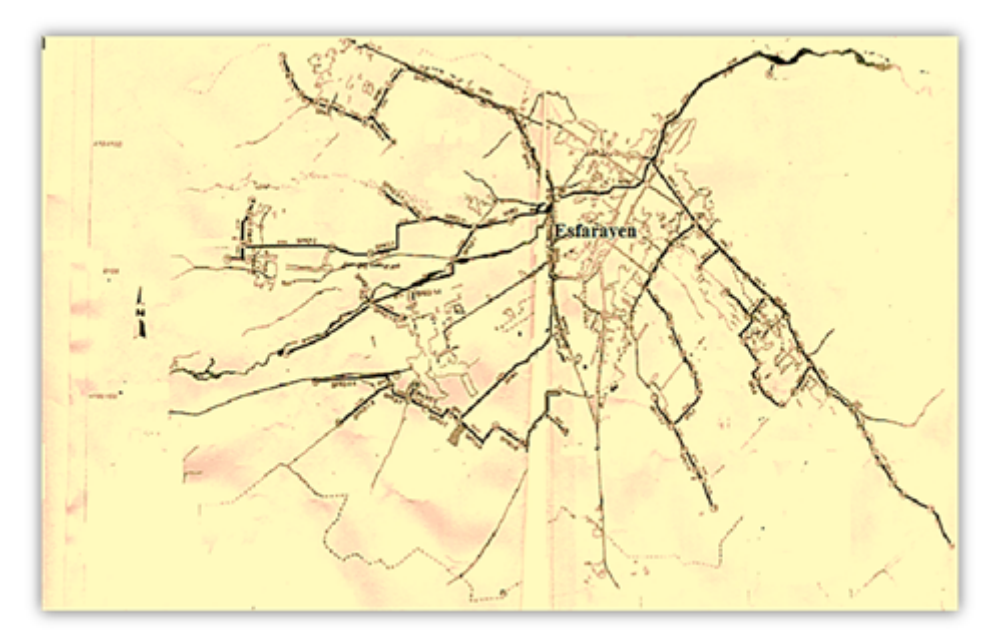
Figure 3: Landscape of irrigation network of Esfarayen County (Bydvaz dam)

Each research topic has its own unique features. However, regardless of the subject of study, all researches have same administrative process, which is the objective of the research. If a proper method is not used, the scientific goals or scientific knowledge is not achieved. Todays, the reliability of scientific achievements gained and influenced by research methods, only (Kalantari, 2009). Selection of a research method is the main part of any study, and it depends on the research subject, expansion of administrative facilities, goals, appropriate assumptions and moral considerations (Ahmadinejad, 2011). This study was carried out by documents and field methods. After reviewing the previous research, the mechanisms of development and organization of WUAs were determined and the criteria related to each mechanism were categorized. Then, according to studies related to the drafts, questionnaires were set up in order to compare activities two-by-two, using the collected data. The population consisted of 40 experts from the Regional Water Company, the board of directors of two WUAs, and outstanding farmers who were the members of those two WUAs. Finally, after completing the questionnaire by the 40 members, we utilized the Analytical Hierarchy Process (AHP) in order to rank activities instrumental in improving and developing the WUAs. The data were analyzed by Expert