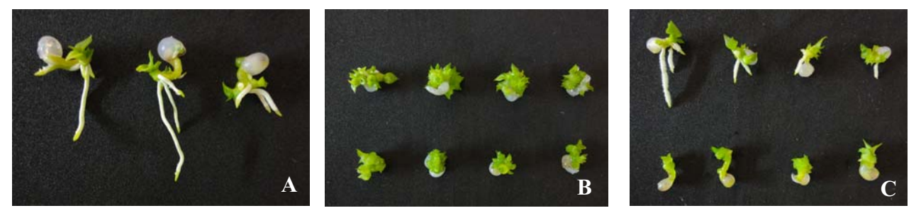
Fig. 2. Phenotypes of synthetic seeds stored in Petri dish at 90-day time point at the end of 50 days of cultivation. (A) Synthetic seeds which were successfully converted into plantlets. (B) Some seeds grew slower and were still at the PLB stageat the end of cultivation. (C) About 15% to 20% of the plantlets appeared elongated. For those stored in screw capped polypropylene tubes, the elongated phenotype was also observed in about 15% to 20% of the plantlets, but only after 120 days of synthetic seed storage.

It was observed that when the encapsulated synthetic seeds were stored for 90 days or longer, the PLBs appeared yellow and unhealthy when they were first taken out from the dark, but when the PLBs were cultured onto ½ MS media, they gradually became green in colour and looked healthier (data not shown). About 15% to 20% of the plantlets which were stored for 90 days or longer also appeared elongated (Fig. 2C as compared to 2A and 2B). This could be due to gradual nutrient depletion when the encapsulated seeds were stored at longer time periods.