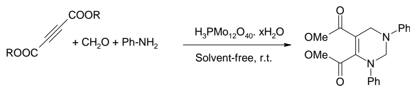
Scheme 2. Preparation of dimethyl 1,2,3,6-tetrahydro-1,3-diphenylpyrimidine-4,5-dicarboxylate.