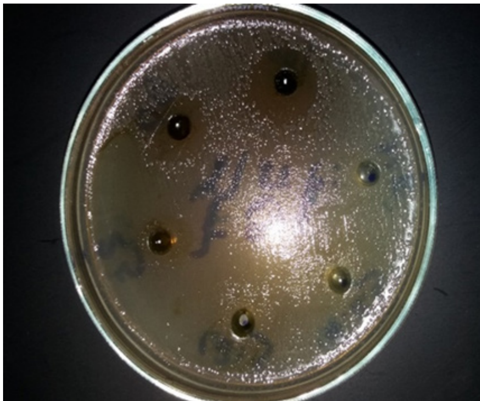
Figure 3. Antibacterial effect of methanolic extract of Pimpinella saxifraga L. against environmental strains of Enterococcus faecalis .