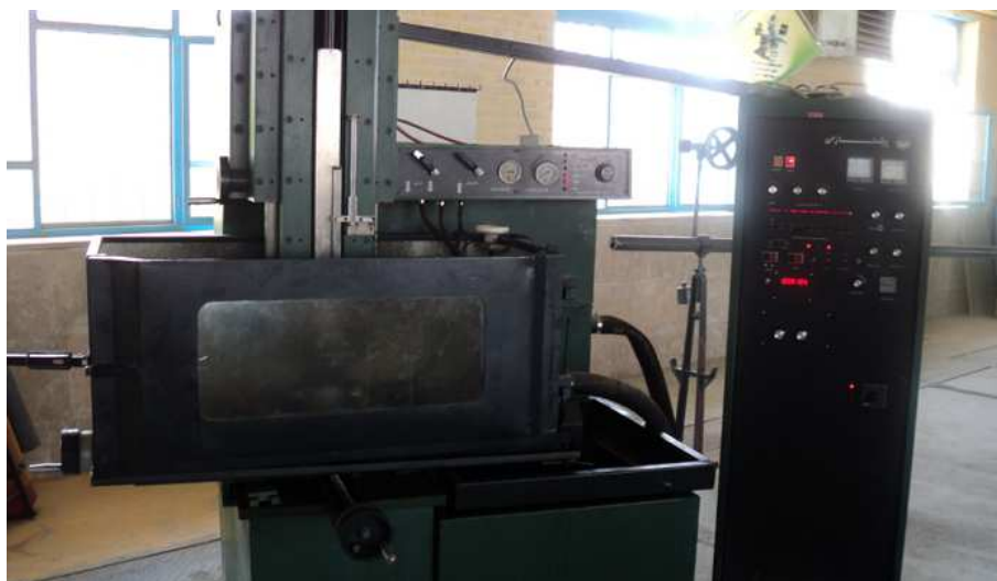
Figure2. Die-sinking EDM set

Die-sinking EDM machine used in this experiment was Pishtazan manufactured by Iran. The photograph of die-sinking EDM set is shown in Figure.2.