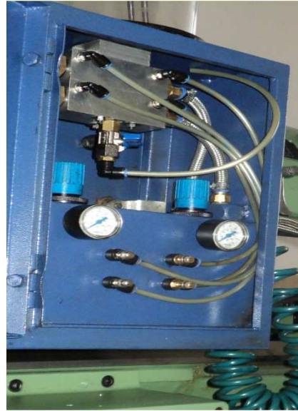
Figure3. MQL set