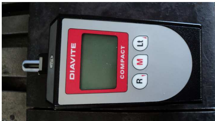
Figure1. The measuring surface roughness machine

The arithmetic surface roughness was measured on the machined surface by using the Diavite-compact model. The accuracy of this equipment was 0.001 microns. The photograph of this machine is shown in Figure1.