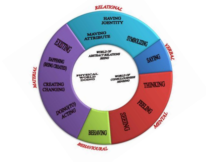
Figure 2: Types of Processes (Halliday & Matthiessen, 2004)