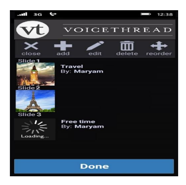
Figure 1. The screen shot of a Sample of Experimental group interaction on VT

Next, the teacher listened to their voice recordings and sent her own comments about them on VT. After listening to the teacher's comments, the students recorded new versions of their voice recordings. Next session, in class, the teacher asked all the students in both groups to make a short presentation of their out-of-class speaking activities. Using strategies such as giving an example and rephrasing, she provided effective feedback to all students in both experimental and control groups. Figure 2 illustrates the cycle of their language learning.