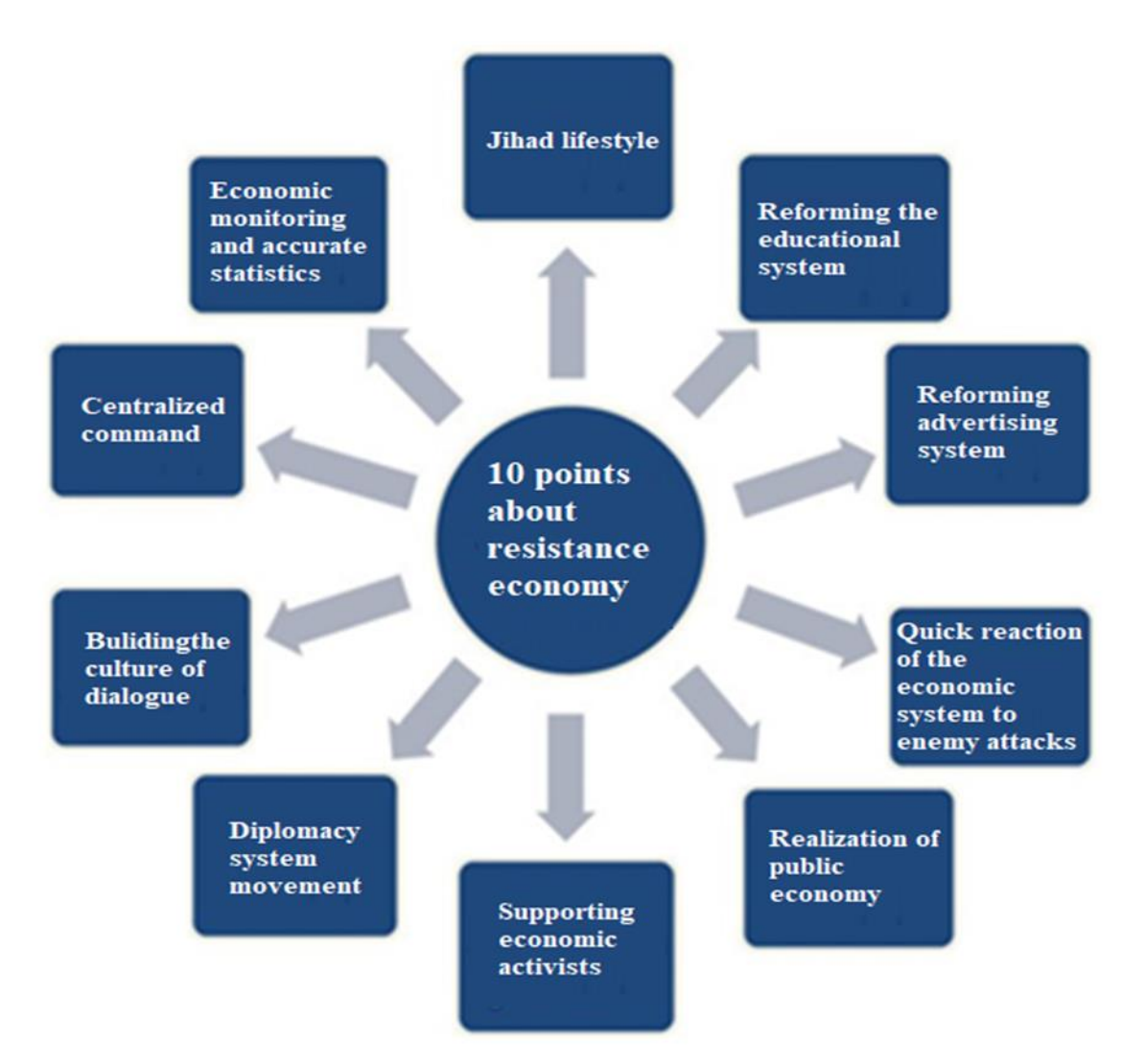
Figure 1. Indicators obtained from Ayatollah Khamenei's statements about resistance economy (Khamenei, 2012)

the Islamic Republic of Iran in the field of resistance economy?