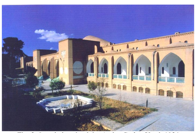
Fig. 3. Iranshahr school, by Andre Godar , Yazd, 1934 (Banimasoud, 2009, p. 11)