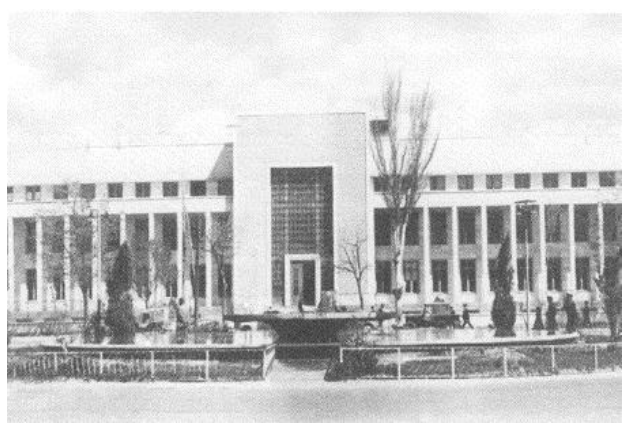
Fig. 1. Iranian National Bank by Mohsen Foroughi, Tabriz (Banimasoud, 2009, p. 229)