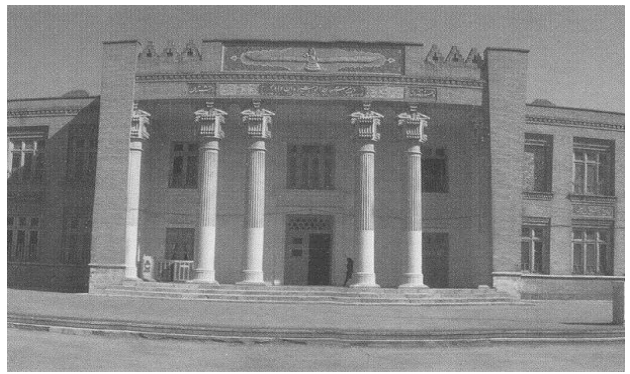
Fig. 4. "Anooshiravan-e-Dadgar" School, Markov, Tehran, 1936 (Banimasoud, 2009, p. 201)