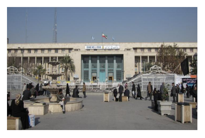
Fig. 2. Iranian National Bank, Tehran market branch by Mohsen Foroughi , 1941