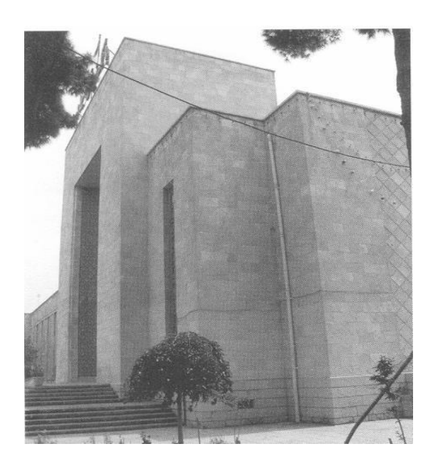
Fig. 7. Isfahan National Bank, by Mohsen Foroughi , 1942 (Banimasoud, 2009) khodam