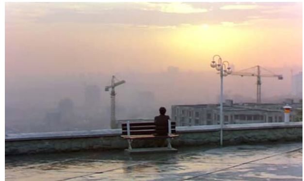
Fig. 6. Polluted cityscape of Tehran in "Taste of Cherry."

As a consequence, Tehran can be an exquisite example for understanding poverty and social difference concepts. In "Crimson Gold" social class conflicts exaggerated to the point that the main character preferred to kill himself instead of living in this city. Some other directors such as "Abbas Kiarostami" attached another perceptual meaning to Tehran. In "Taste of Cherry" Tehran resembled as a place suffered from lifestyle changes that direct people to suicide and depression. Furthermore, in this movie public places are used to induce symbolic meanings. "Dar Abad Wildlife and Nature Museum" take a symbolic role to show that the people who live in Tehran are almost the same as dead animals maintain in this museum, also polluted cityscape of Tehran was captured from this museum, to reinforce the sense of depression (Fig 6).