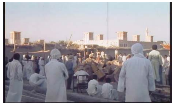
Fig. 9. Wind catchers of the city in "Captain Khorshid."

On the other hand, in southern cities, that harsh looking does not exist anymore. In reality, traditional architecture of those cities and elements like wind catchers created a unique panorama for these cities which has Iranian identity. For example, in “Captain Khorshid” the wind catchers of “Bandar Lengeh” make sense of place and take aesthetic roles in the movie (Fig 9). Furthermore, being located adjacent to the sea made another visual affordance for directors, and all the southern movies get benefitted from this visual potency.