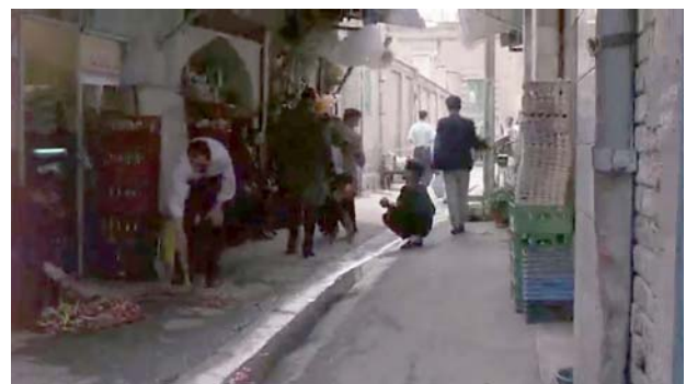
Fig. 4. An old alley in Tehran pictured in " Children of Heaven ."

" Captain Khorshid ," and " The Jar ," are good examples of the second type. Both movies illustrate the traditional physical structure of Bandar Lengeh and Yazd cities.