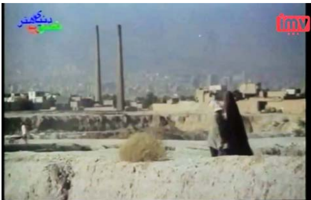
Fig. 5. Suburban area in "The Blue-Veiled."

The last group contains movies which are captured in outskirts of Tehran. In these movies, places do not obey any architectural or urban rules, and they have used primitive unorganized urban design. Their images do not have a detailed structure, and they are full of immigrants, which came from rural areas. These physical environments are symbols of Tehran's disorders and poverty. These places also show neglected theories, about urban development in Tehran which began after the long war. "Rain" and "The Blue-Veiled" movies have several sequences in these areas. In "The Blue-Veiled" brick furnaces located outside of Tehran exhibit and introduce the place, where the main character lives (Fig 5).