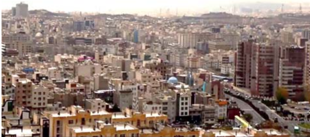
Fig. 7. Cityscape of Tehran captured in "Melbourne."

Iranian filmmakers, especially in these award winners and prominent works, get advantaged from aesthetic potentials of cities. As mentioned before, cities presence in films can be categorized into two groups of Tehran and southern coastal cities. The visual language of these two types is different. In Tehran because of its large expansion, and diversity of views usually wide panoramas from cityscape are so desirable. For instance, in “Melbourne” the first sequence is the silhouette of Tehran (Fig 7). Other desirable views of Tehran are towers and landmarks, which obey modernism rules, narrow old alleys of downtown, which follow the traditional urban design in Iran, and also some famous streets which are fulfilled by cars. According to the analysis, filmmakers did not show any interest in details of urban design and usually they broadcast an overcrowded city via medium or long shots and close shots are not preferable. Additionally, the visual attributes of Tehran came to dialogues of the movies such as “The Last Step.” The man says, “Nothing bothers me anymore even the nasty appearance of buildings in the city” (Fig 8). Although Tehran has diversity in views and cityscapes, this city does not sound so beautiful among directors.