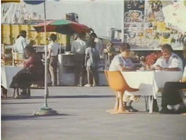
Fig. 10. Public place near the sea in "The Runner."