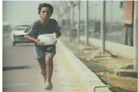
Fig. 2. Use of urban roads in "The Runner."