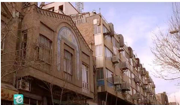
Fig. 8. Chaotic urban facades in "The Last Step."