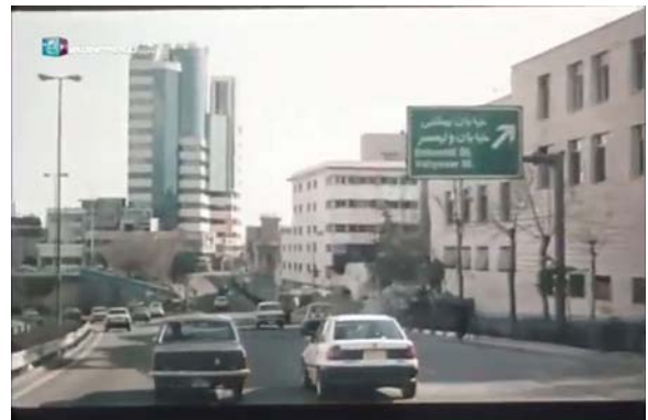
Fig. 3. Using a tower as a landmark in “Under the Cities’ Skin.”