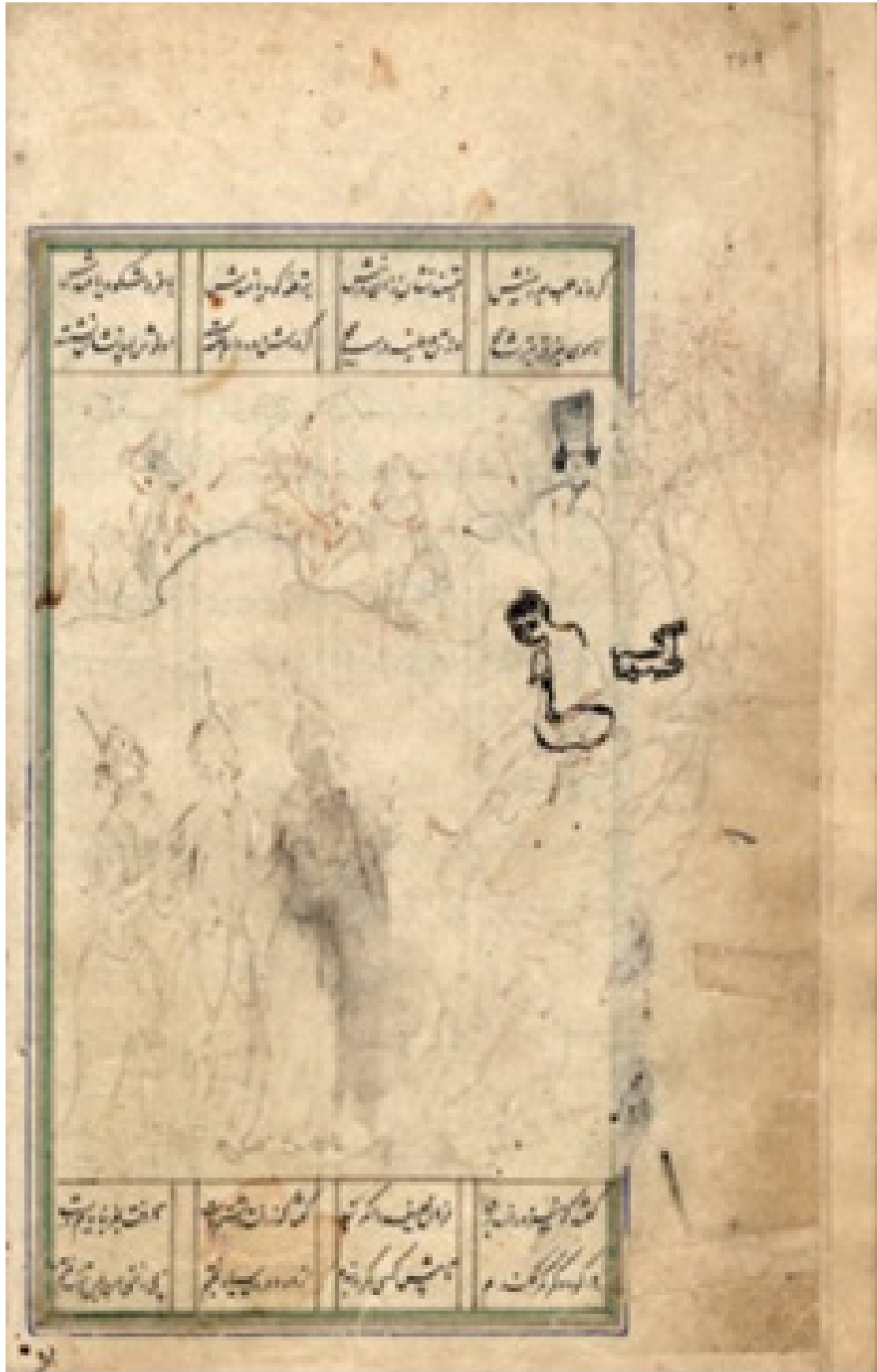
Fig. 8: Erasing the damage caused by human interventions in Photoshop (Authors, 2018).