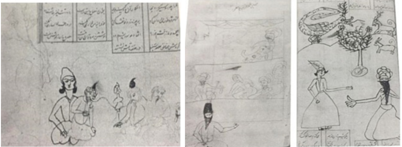
Fig. 6: Damage caused by human interventions to manuscripts of Malek Museum.

again. We started renovating and retouching the work. Finally, the retouching process was completed in Photoshop with 30 layers, and the work kept its original nature (Fig. 9).