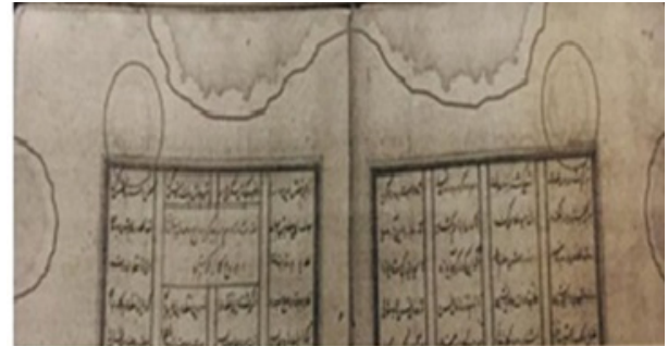
Fig. 5: Fungus stains on the manuscript (Malek Museum).