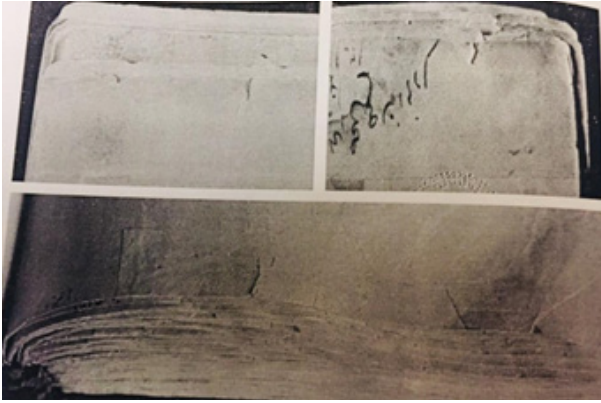
Fig. 1: The damaged edges of the designated version (Malek Museum).