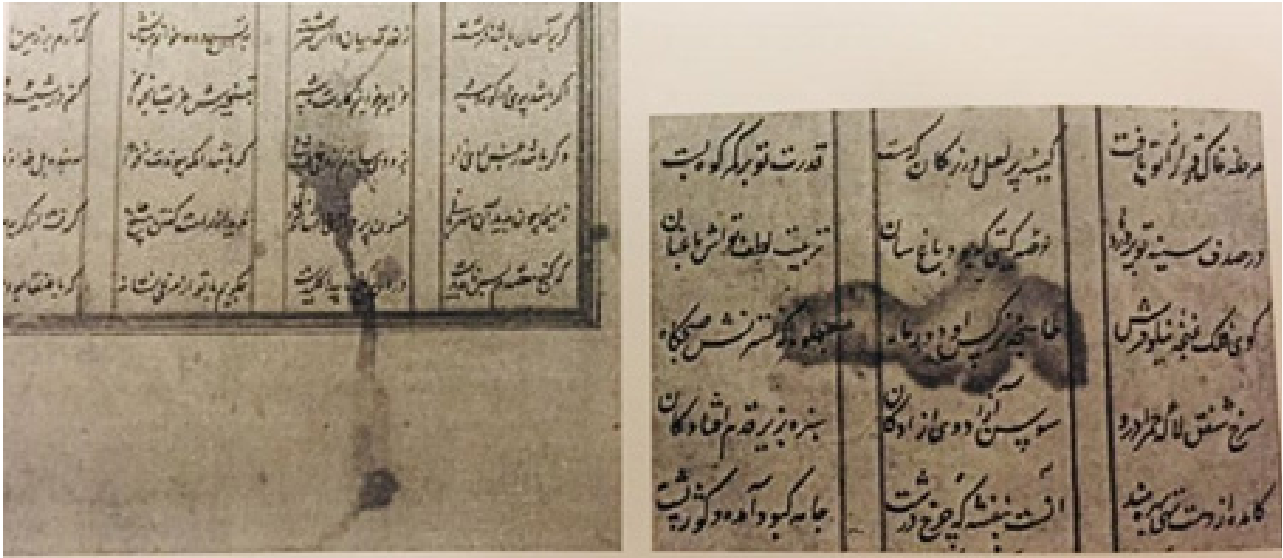
Fig. 3: Various stains on the manuscript sheets (Malek Museum).