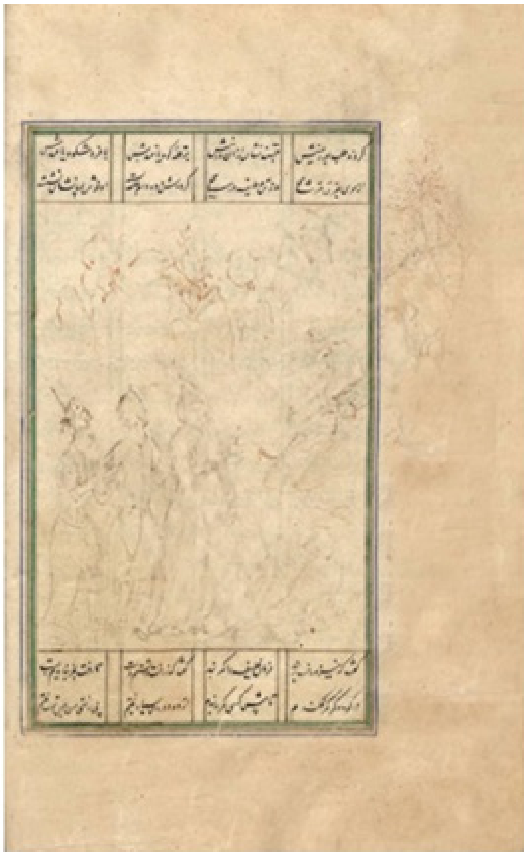
Fig. 9: The final result of digital (virtual) restoration on the designated version (Authors, 2018).