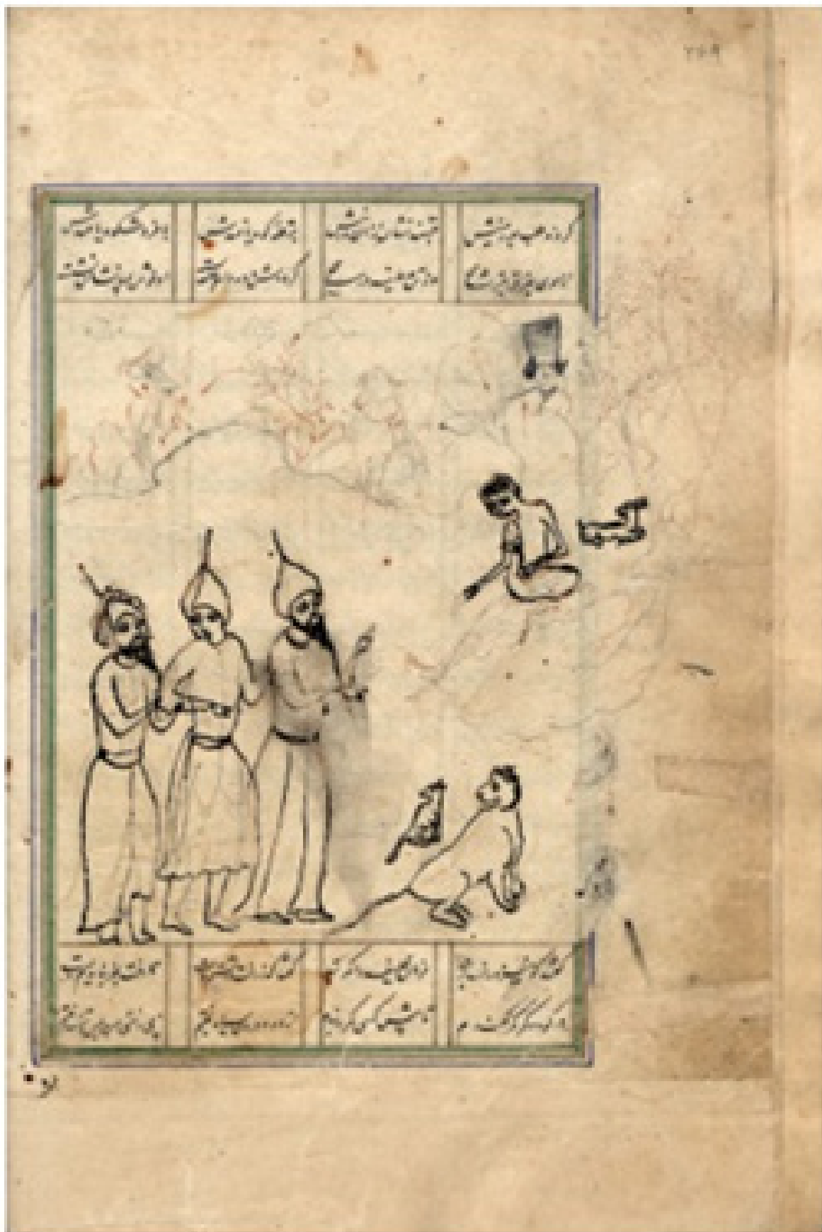
Fig. 7: The designated page and damage caused by human interventions (Malek Museum).