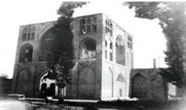
Fig. 3: Jahan Nama Palace by Joseph Papazian in Golestan Palace photo album (Shojaei Isfahani 2016: 38).