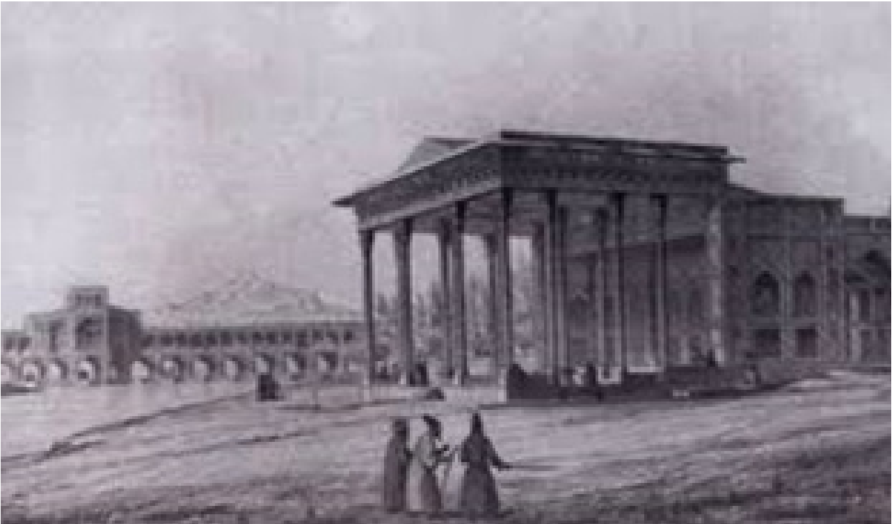
Fig. 2: The Ayeneh khaneh image before the destruction (1936: 256).