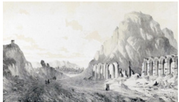
Fig. 4: The ruins of Farah Abad Palace (Flandern 1936: 244).

Among the disputes within the government and when a person holding an office and having power was subjected to royal wrath after killing the person in question, the buildings built by him were destroyed to destroy any evidence of his presence. An example of this work regarding Sarutoghi, the chancellor of Shah Abbas II, can be seen that according to historical evidence, after his murder, his palace, which is described as one of the most beautiful palaces in Isfahan, fell into ruins. After a while, it was used as Darugheh's residence by the Shah's order due to the usurpation of the place, he preferred to build a home and works for himself next to the ruined buildings (Chardin, 2000: 24). It is true about the change of use of Jarchibashi Palace, which Shah Abbas angered, and after the seizure of his property, his palace was handed over to its representatives at the request of the British Company for this country's trade house. This was even though they were destroyed after a few decades and the decline of their business. According to reports, the paintings, gilding, elaborate ceiling decorations, doors, and walls were lost (Ibid).