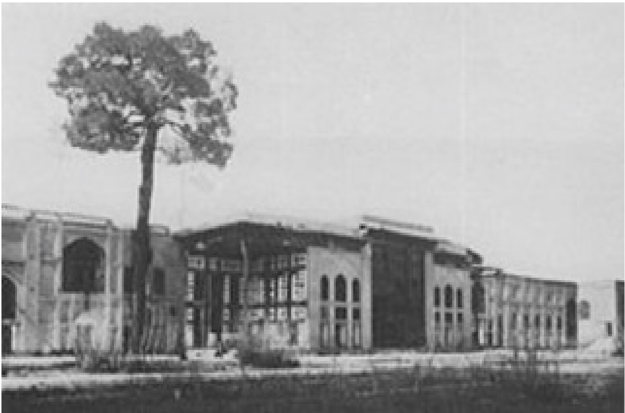
Fig. 1: A view of Haft Dast Palace before destruction (Holetzer 1930: 131).

On the other hand, in the 11 and 12 th centuries of A.D., two powerful political and religious families were founded in Isfahan, Al Khanjad and Al Sa'id, with two religious' tendencies, Shafi'i and Hanafi. They ruled this city for They had a bigoted spirit, which is why many religious conflicts arose in this city and caused many killings and destructions (Kasaei, 1979: 976; Kajbaf, 2006: 19). In the year 1181 A.D., there were terrible wars for eight days between Sadr al-Din Abdul Latif, son of Abu Bakr Khanjadi and other religious leaders. In these conflicts, many people were killed, and many houses and markets of Isfahan were burned and destroyed (Ibn Athir, 1965: 319). Religious differences and conflicts continued in Isfahan in different periods and were not unique to a particular period. As Ibn Battuta, a traveler in the 14 th century after visiting the city of Isfahan, although he described it as large and beautiful, he pointed to the destruction of many parts of the city. Isfahan and its buildings considered this to be the result of differences between the Sunnis and Shiites of this city (Ibn Batuta, 1991: 246). Although there are many reports about religious conflicts in Isfahan (Nasvi, 1965: Notes 219 and 316), in a few of them, in addition to explaining the disputes, they have mentioned the destroyed buildings (Banakti, 1969: 365; Khafi, 1962: 254, 1965, Vol. 1: 296).