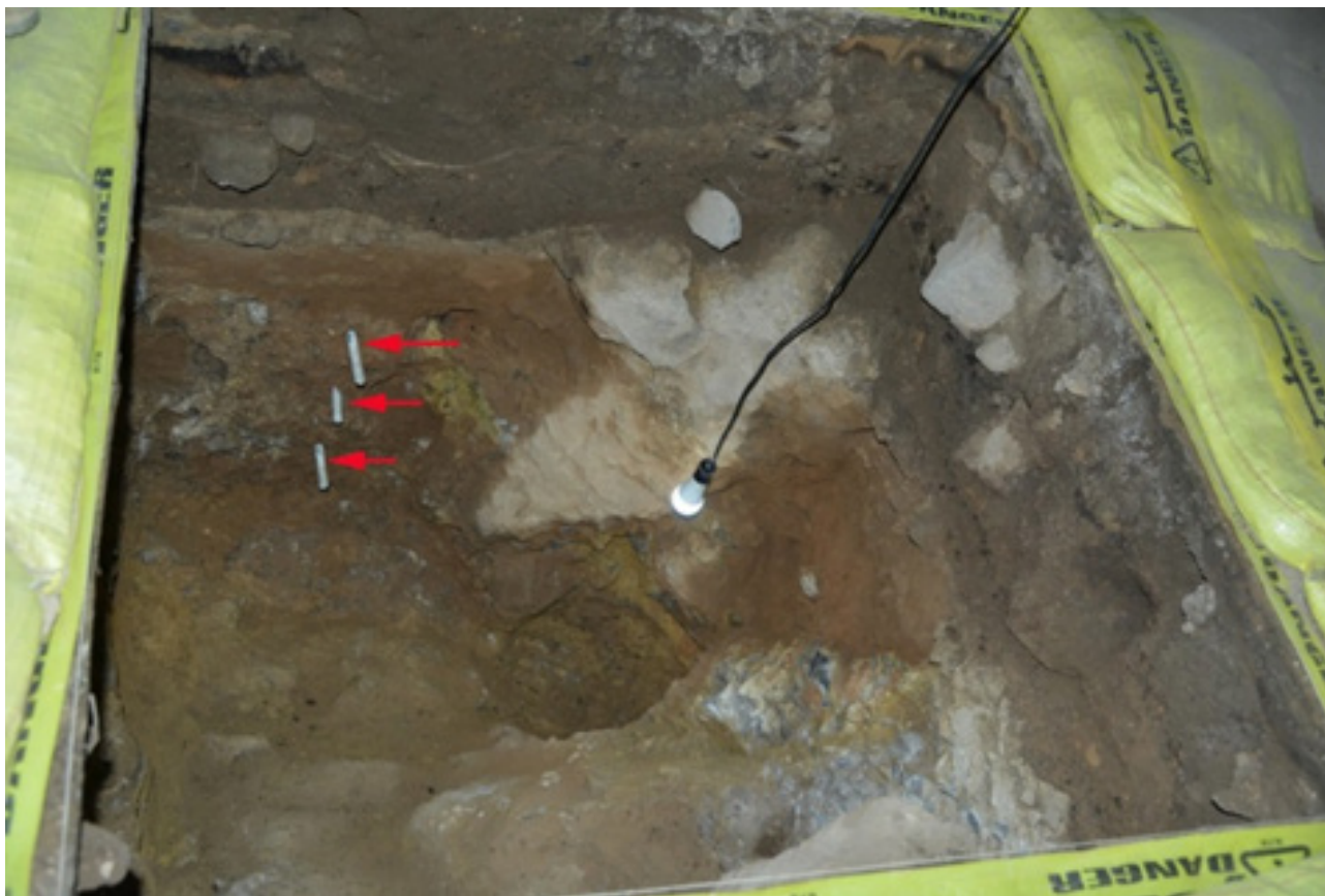
Fig. 2: Location of the Dosimeters Shown Within the Section.