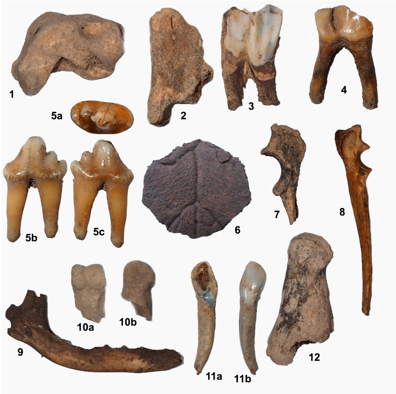
Fig. 6: Selected Bones and Teeth of Large Mammals from Kaldar Cave from the 3 rd Excavation Season

moment of the M.P. to U.P. transition of the region is not yet exactly known and more precision could be obtained by dating the boundary between layers 4 and 5 of the Kaldar Cave and other sites sequences. We also recovered a fragment of a human skull from layer 4. Although DNA analysis confirmed its human nature, an initial attempt to date the specimen returned a nearly recent date, which is most probably due to contamination. For this reason, we prefer to wait for the next excavation and then try to find more human remains.