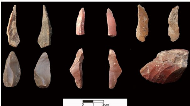
Fig. 5: Selected Artifacts from Upper Paleolithic of Kaldar Cave 3 rd Season.