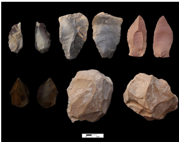
Fig. 4: Selected Artifacts from Middle Paleolithic of Kaldar Cave 3 rd season.

Here, a small selection of the lithic industries from layers 5 and 4 are shown (Fig. 5). A paper that provides a detailed study on the industries is in preparation.