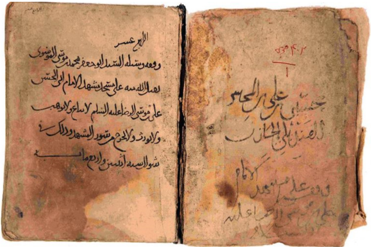
Figure 1: An example of the deed of endowment for the Quran by Abu Ja'far Musavi (Kariminia, 2020: 99)

tion, there was a defensive wall around it.