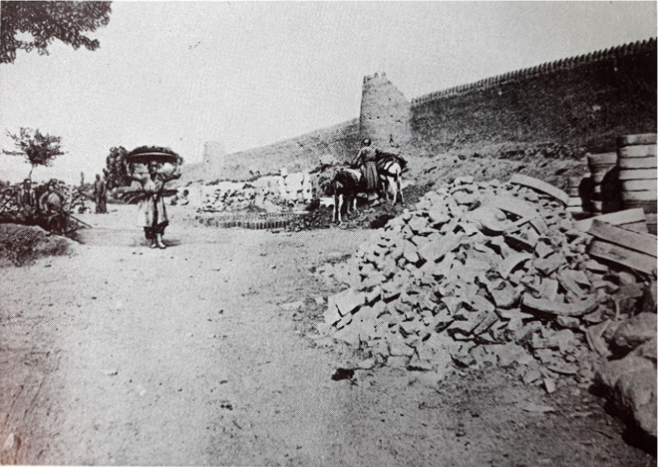
Figure 3: The tower and defensive wall of the city of Mashhad (Mahvan, 2012)

Contrary to oral statements, there is no evidence of the construction of the defensive wall during the Timurid period. It seems that the defensive wall built in the year 515 AH during the Timurid period did not have any defensive functionality. Evidence of this is reported during the Uzbek attack on Mashhad in the year 913 AH. Mohammad Qasem, the son of Sultan Hossein Mirza Bayqara created a barricade around the city by using the walls of the last houses and blocking the streets on the outskirts of the city. However, even with this, he could not resist the Uzbek attacks (Ruzbahane Khonji, 1978: 188).