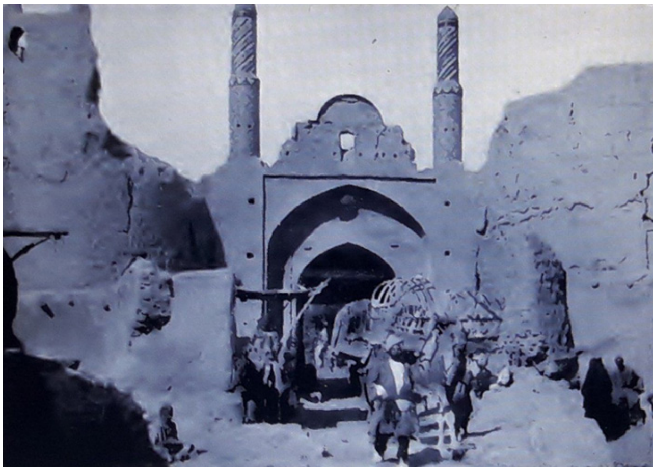
Figure4: The gate of Nowghan in Mashhad (Mahvan, 2012)