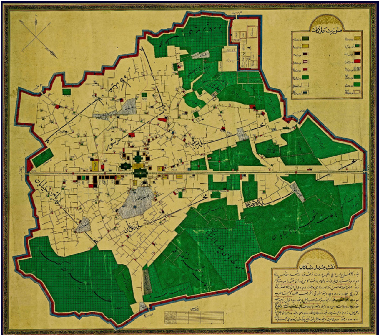
Map 1: The map of holy Mashhad for the year 1286 AH (the archive of the specialized library of Mashhad studies)

defenders of Kian Castle can repel them from another tower. The city fortress, surrounded by an expanse of one Farsakh, has a hundred and forty-one towers. The city citadel, which is connected to the suburbs and is part of it, situated in the western part of the city, has eight towers, connecting to the desert on both sides. At these times, the city of Mashhad has six gates with the following names: Nowqan Gate, Lower Street Gate, Upper Street Gate, Sarab Gate, Arg Gate, and Eidgah Gate. It is evident that the city also had two other gates (Sani' al-Dawlah Vol 2, 1923: 238).