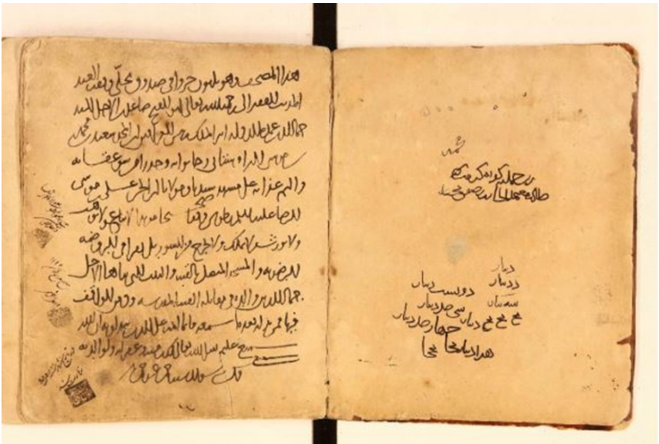
Figure 2: A sample of the deed of endowment of the Quran by Abolfath Al-Baravastani (Kariminia, 2020: 99)

A new defensive wall was constructed by Shah Tahmaseb Safavi around the city for the last time between the years 935-942 AH. The construction of this wall was completed in the year 942 AH. It is presumed that Tahmasbi defensive wall is the same one that was visible around the central core of the city of Mashhad until the early years of the reign of Reza Shah.