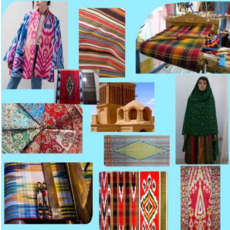
Figure 1- Storyboard

The implementation of the practical part of the project began after studying and knowing the history and characteristics of the art of simplism by preparing images of subjects related to this art, especially simplistic works in the field of fashion, and preparing a storyboard. Based on the title and purpose of this research, images of some traditional fabrics have been included in the design for inspiration and integration with other images, which were chosen only according to the researcher's taste.