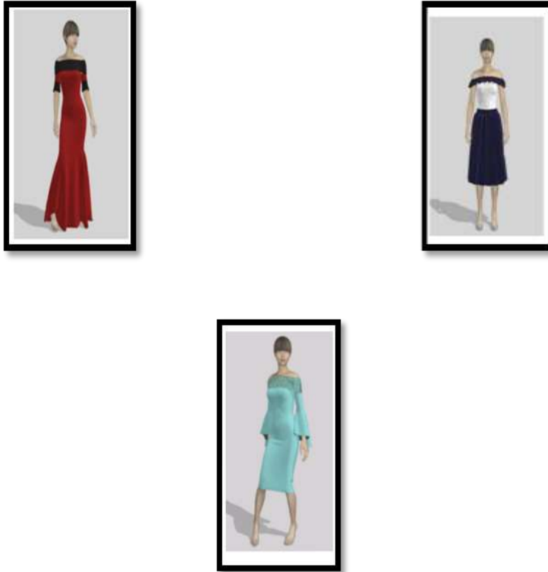
Figure 5- Approved color etudes

At the end, among the color etudes, the best combinations were selected for the next steps.