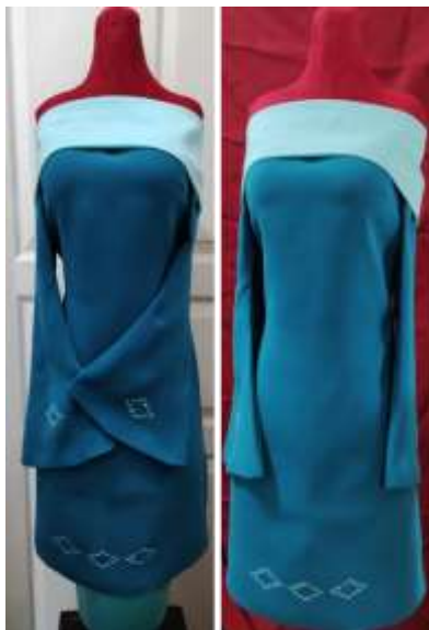
Figure 9- The final stitching of design number (1)

In this design, it has been tried to use minimum cuts and motifs according to the characteristics of minimal, which is based on simplicity, and also in choosing the color of these clothes, the colors of the poetry fabrics, which are traditional fabrics of Yazd, have been used. Additions and colorful items should be removed and replaced by one hand and one color.