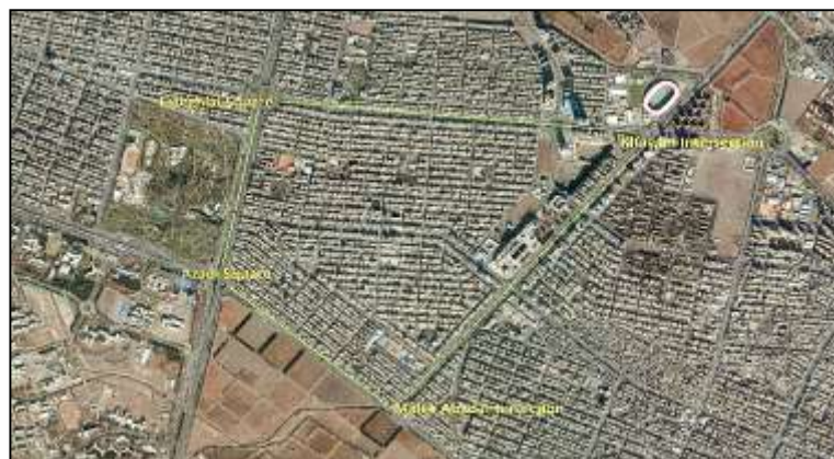
Fig 5: Aerial Image of Sajjad Neighborhood (Authors, 2016)