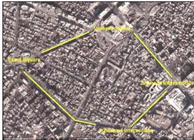
Fig 4: Aerial Image of Sarab Neighborhood (Authors, 2016)