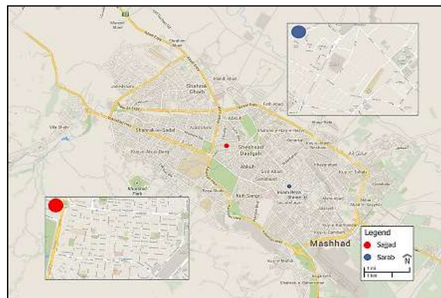
Fig 3: Sarab and Sajjad Neighborhoods Location in Mashhad (Authors, 2016)