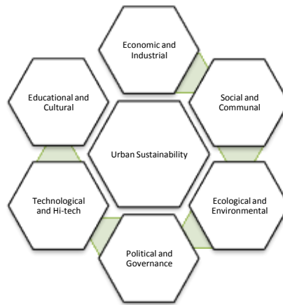
Fig 2: Aspects of Urban Sustainability (UNSD, 2016)