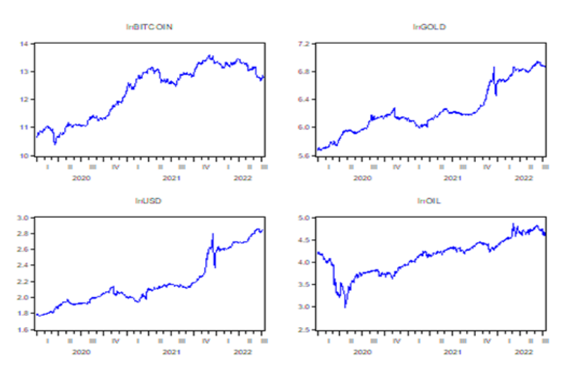
Fig. 1: Time Series of Variables