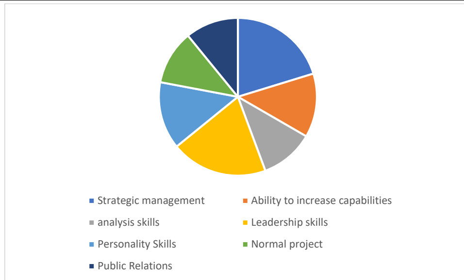
Fig. 3: Scores and Prioritization of Sub-Components