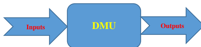
Fig. 1: Data Envelopment Analysis Model

In the present study, the variable assessed was risk disclosure. First, financial reporting were evaluated for the first level of critical discourse analysis based on Norman Fairclough’s model, followed by assessing the text in terms of disclosure of positive or negative risk words.