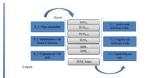
Fig 1: Data Envelopment Analysis Model

Inputs included: major shareholder, board independence, the duality of CEO duties. Outputs included: positive risk disclosure words, negative risk disclosure words, capital adequacy ratio. In the present study, the variable assessed was risk disclosure. First, financial reportings were evaluated for the first level of critical discourse analysis based on Norman Fairclough's model, followed by assessing the text in terms of disclosure of positive or negative risk words.