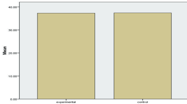
Graph 1. Result of the pre-tests

The result of the Levene’s test for equality of the variances showed that there was no difference between the variances and they are equal. The significance value reported for Leven’s test was .870, which was larger than .05 and not significant. Therefore, the row in which variances are assumed to be equal should be considered. So t_{38} = -.086 and the significance level was .932 which was greater than .05 and it showed that there was statistically no significant difference between the pretests of both control and experimental groups. The score in pre-test was out of 150 so maximum and minimum scores in pre-test were considered 150 and 30 respectively.