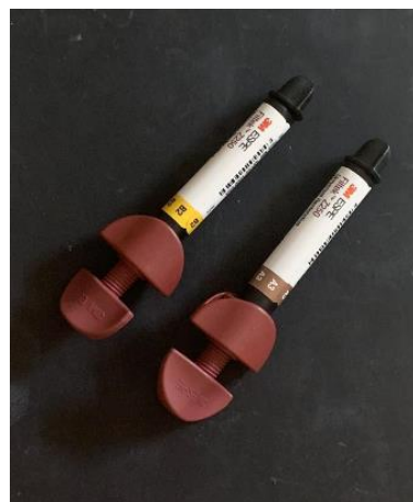
Figure 1. Z250 composite

In this experimental study, Z250 universal composite (3M ESPE, USA) was used (Figure. 1).