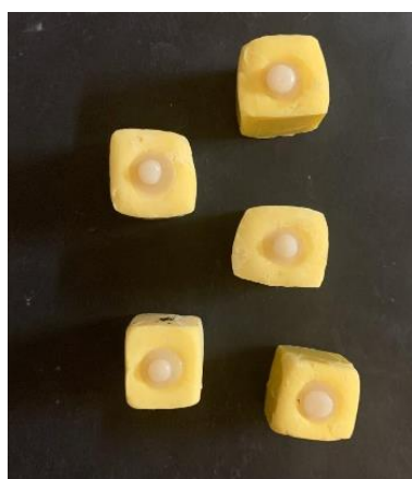
Figure 2. Prepared samples

80 rectangular cubes were prepared with dimensions of 17×17 mm and a height of 15 mm using radiographic films. At the center of each acrylic cube, a hole with a diameter of 6 and a depth of 2 mm was created and filled with the desired composite (Figure 2). After being pressed by a glass slide, they were exposed to curing light (Dentamerica, Litex 695, Taiwan) for 20 seconds, without removing the slides.