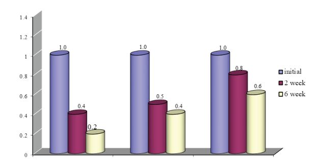
Figure 3. The mean of BOP at different times after treatment in 3 groups

The mean value of bleeding on probing significantly decreased after 2 weeks and 6 weeks from baseline in the laser (P<0.001) and PDT treatment (P=0.002) groups; however, it did not differ significantly in the control group (P=0.223). According to the results of Kruskal-Wallis's test, the mean value of bleeding on probing did not show a difference between the studied groups in three different time intervals (Figure 3).