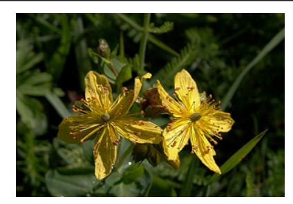
Fig. 1. Flowers of H. richeri Vill.

inhabitants about the use of the flowers of H. richeri Vill. with or without the contemporaneous presence of flowers of H. perforatum L. in the preparation of an ointment. This ointment is obtained by maceration of these plants organs in olive oil and is traditionally used to cure skin disorders such as wounds and burns. Recent studies on the phytochemistry of this species have been mainly conducted on the composition of the volatile fraction (Maffi et al., 2001; Ferretti et al., 2005; Maggi et al., 2010) from Italian and European accessions, mainly of Balkan origin (Smelcerovic et al., 2007). The analysis of the polar fraction revealed the presence of flavonoids, naphthodianthrones and phloroglucinols (Maffi et al., 2001; Smelcerovic and Spiteller, 2006). Also, the biological activities as antioxidant (Zdunić et al., 2011), antimicrobial (Maggi et al., 2010), antiinflammatory and gastroprotective (Zdunić et al., 2010) agents have been explored in recent times.