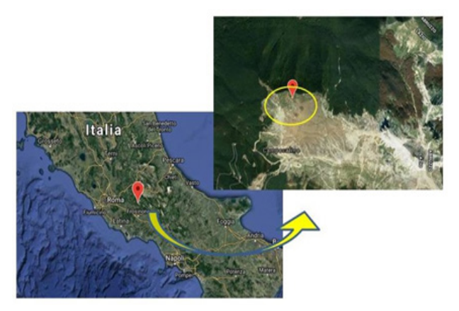
Fig. 2. Satellite view of Central Italy and expansion of the collection area.

All the solvents having RPE purity grade if not differently specified, were purchased from Sigma Aldrich as well as the deuterated solvents and the methanol of HPLC grade, whereas silica gel was purchased from Fluka Analytical.