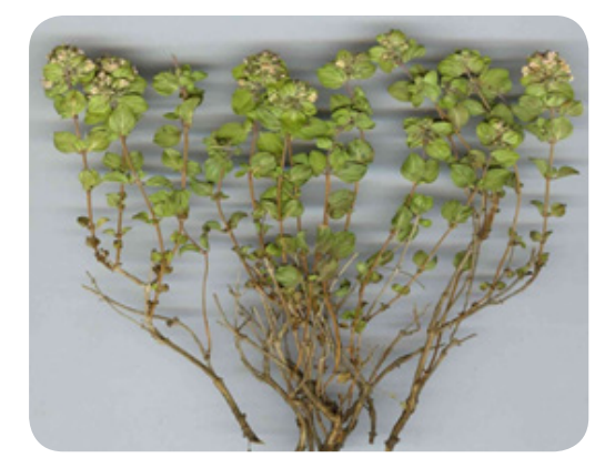
Fig. 1. Representation of Thymus kotchyanus L.

The aerial parts of T. kotchyanus L. (Fig. 1) were collected in the blooming period from Tash Mountain (2120 msl), Semnan Province, Iran (Fig. 2) in early July 2015.