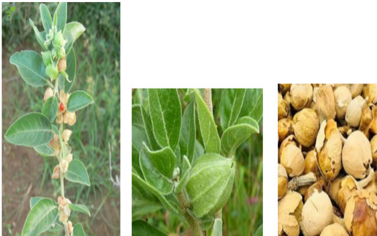
Fig. 1. Withania coagulans plant and fruits.