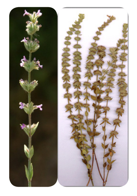
Fig. 2. Satureja myrtifolia plant at flowering period (A) and at maturation stage (B).

Two solvents (water and methanol) were used for the extraction of TPC. 1.0-gram portions from the aerial parts of S. myrtifolia plant (leaves and steams) were powdered and extracted for 24 h with 20 mL of water or methanol (95%) at room temperature (30 °C), followed by rapid paper filtration through a Whatman No 0.45 mm filter paper. The resulting solutions were evaporated under the vacuum at 30 °C by Buchi Rotavapor R-200 to dryness. The residues were then dissolved in 3 mL of water or of methanol. The extraction yields (w:w) were: 24% (water) and 18.65%