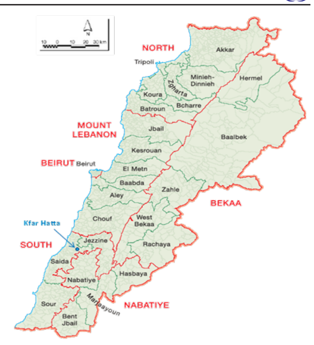
Fig. 1. Geographical map of Lebanon country showing study area (South) with the sampling site (kfar Hatta village).

2.2. Extraction of total phenolic content