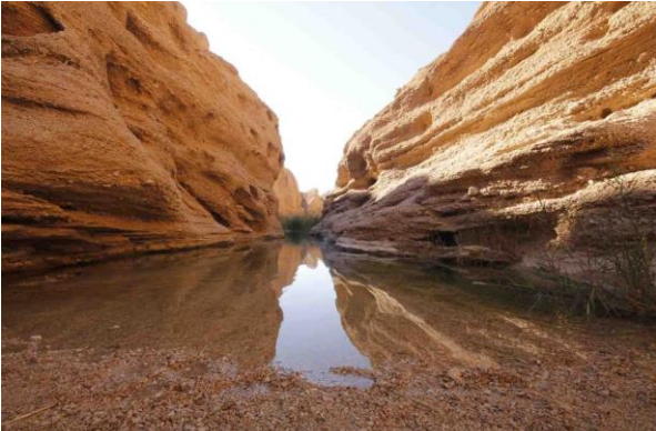
Picture 1- Kal-e Jeni Canyon in south Khorasan province (Abstracted from: www.irandoostan.com)

- Special attractions e.g. Iranian dishes, nomads of Iran, traditional instruments, etc.