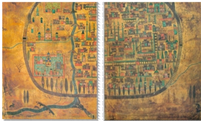
Fig. 1: Tabriz miniature drawn by Nasuh in 1536 AD (Source: Yourdaydin, 1976b)

According to Albert Gabriel, the analysis of the structure of Istanbul shows that these images can be used as city maps which in addition to the information on the topography; reflect the architecture type from Ottoman view. The image analysis also helps in determining the internal structure of cities according to contemporary methods (Kosebay, 1996). Walter Denni, an American researcher, studied the details of the Istanbul's map written by Nasuh. The title of his study is "The Architecture of Istanbul in the sixteenth century". In this work, the researcher attempted to compare the illustrated buildings with the existing reality. According to him, some tombs, especially those located in large cities, from the viewpoint of architecture and topography are consistent with reality. Among them, however, some are similar to each other and copied each other. He has completed the list produced by Gabriel through indicating the possible similarity of 121 locations which has been numbered by him. Thus, the images of Istanbul, Diyarbakir,