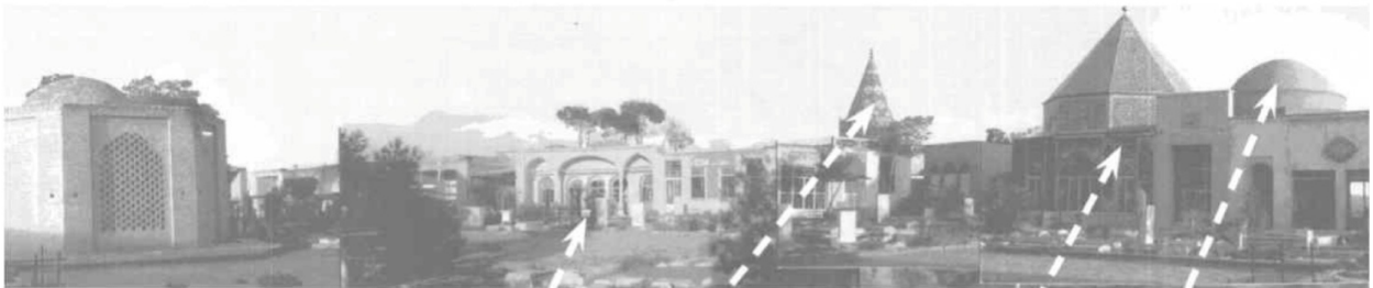
Takht-e-Foulad Cemetery in Isfahan – before destruction (1977)