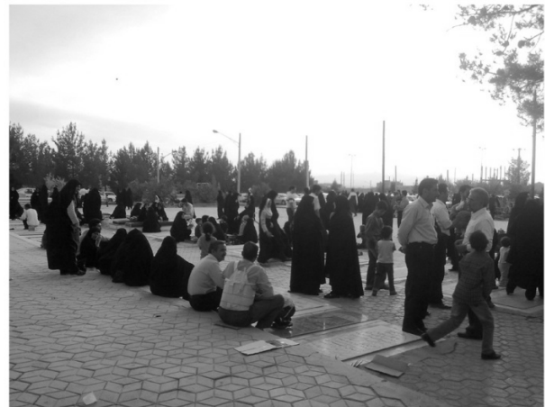
Fig. 2: Scenes from social interaction of citizens in cemetery (Cemetery of Ardakan, Yazd, Iran)