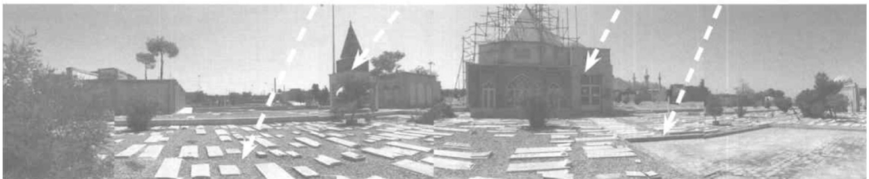
Takht-e-Foulad Cemetery in Isfahan – after destruction (1977)