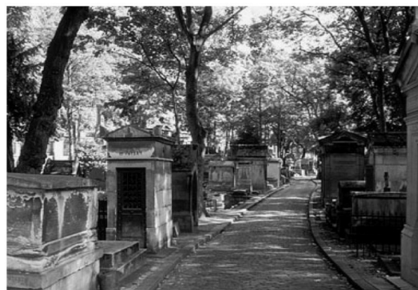
Fig. 3: Scenes from Père Lachaise Cemetery in Paris