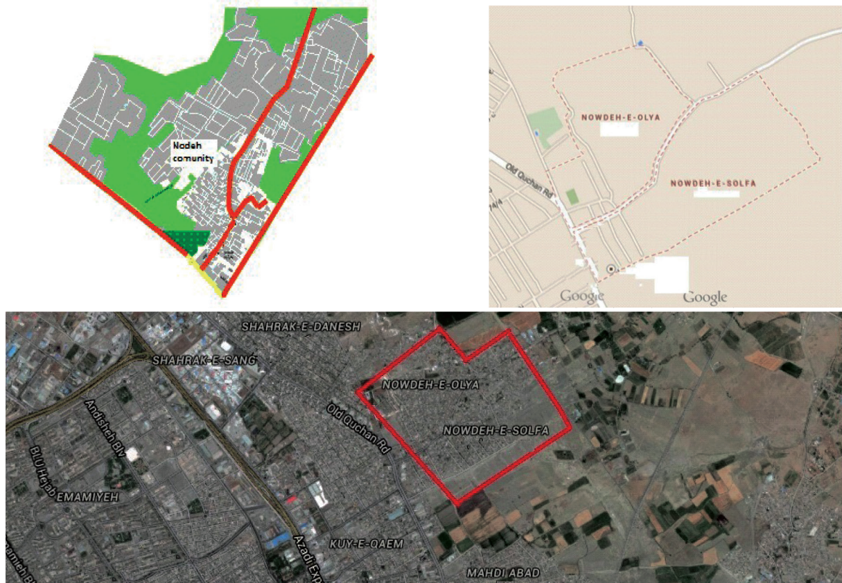
Fig. 1: Location of case study, Nodeh (Mashhad, 2014)

This village with 500 years of history and a 20000 population at the time of implementation of the design is located at northeast of Mashhad and on the brink of old Ghuchan road and tomb of Ferdowsi. Most of its inhabitants are farmers and ranchers of south and north of Khorasan who emigrated to this village after being jobless due to draught. This village has other characteristics such as: family depth is 5/5 persons, the people are from Turk, Kurd, and Fars races, most of people are engaged in and farming, most of the population is consisted of young generations, 98 percent of them are Shiites and 2 percent are Sunnis, 90 percent of them are in lower living conditions and others are in middle living conditions, 25 percent of the population are illiterate, 35 percent has elementary education, 20 percent secondary education, 17 percent high school education and 3 percent has passed university education (Fig. 1).