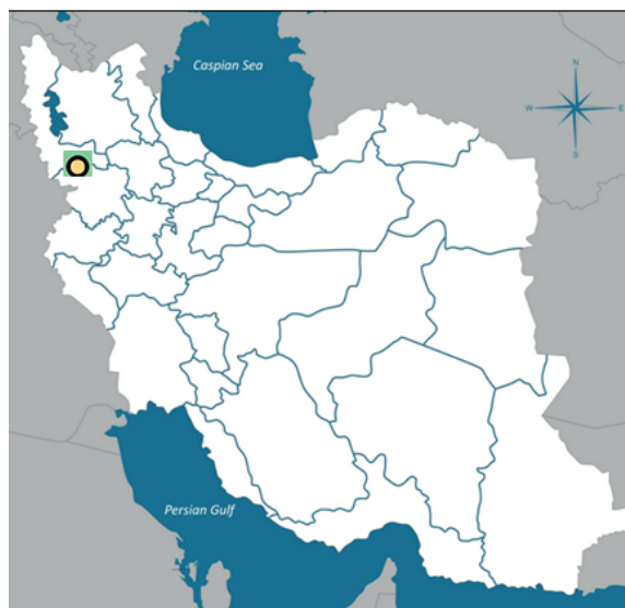
Fig. 2: Case study Region.

latitude and the height from the see is nearly 1496 meters (Fig. 2). According to the last official census (2012), the population of Saqqez is nearly 208,425 which among these, 150000 live in city center and the rest live in other towns of the city. The city area is equivalent to 15.49 % of the total province area. Saqqez is surrounded by West Azerbaijan in North and West, by Marivan and Iraq in South, by Divan dare in East (Consulting Engineers of Piravesh, 2007).