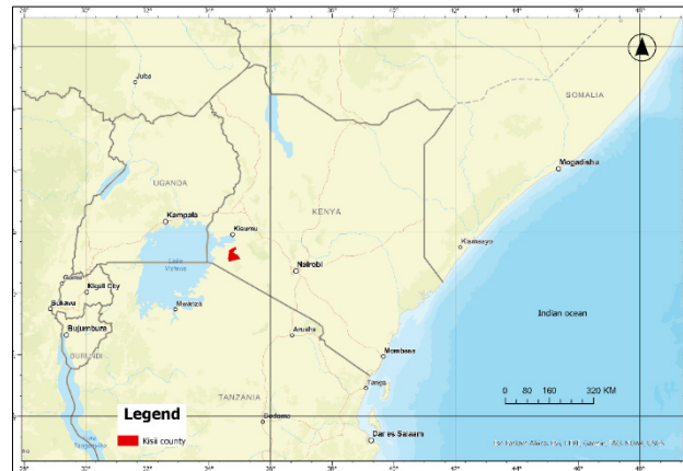
Fig. 1: Geographic location of Kenya and Kisii County