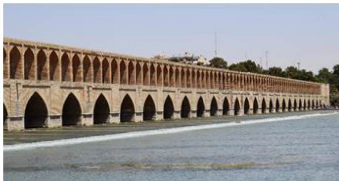
Fig.1: Allahverdi khan bridge