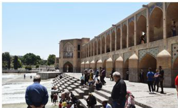
Fig. 2: A side view of the Khaju Bridge; Isfahan City

Due to the presence of its lower surface, Khaju Bridge can provide too many of these recreational functions together (Moravej Torbaty & Pour Naderi, 2014). Providing the possibility of people's presence near to the water stream and allowing them to have a sensory contact with the water flow gives the bridge a different quality compared to other urban bridges that have been constructed only for crossing over the water. The people's presence near to water flow has been possible by establishing the bridge columns on the lower floor to let them get access to each other and cross the bridge through the first floor, next to the water. The cool weather, the smooth breeze blowing over the river, the sound of water flowing under the Khaju Bridge, and the area around the river has turned it into a great urban recreational space. Moreover, the water flowing over the eastern stairs make a pleasant natural sound for the people who are passing by these areas; finally, people are possible to go down the stairs and sit by the river, touch the water surface and make a closer physical connection with the water stream and Nature. The river's landscape appearing