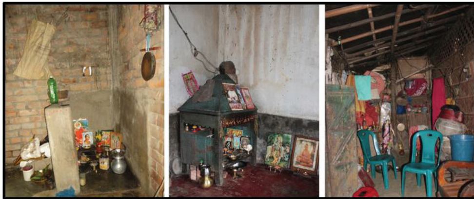
Fig. 3: Religious space of the house

When the household size increases, they need to extend the house. Generally, the extension is done on the backside of the house where the kitchen is built. By shifting the kitchen, another sleeping area is added if possible. The bamboo mat wall is used for room extension and partition wall. The roofing materials are kept similar to the original house. At present due to the insufficiency of spaces in the village, inhabitants have to construct a new room next to an existing housing unit sharing a