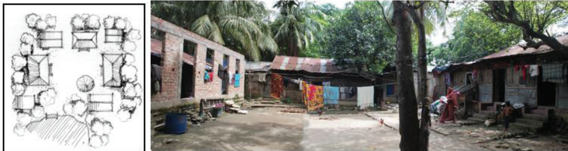
Fig. 4: (Left) Typical courtyard plan; (Right) Photograph of a typical courtyard