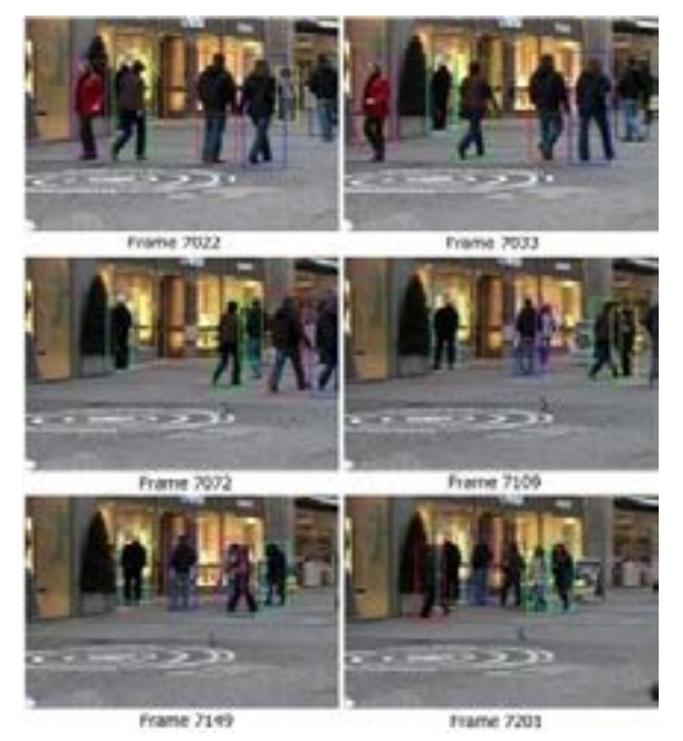
Figure 4- Selected frames of the tracking results from the TUD-Stadmitte dataset

We have used fixed parameters for all three datasets and since the frame rate is lower for the Pets dataset in comparison to the other two datasets; we should set the parameters so that they would be suitable for this dataset. Also our method shows that it can achieve better results for videos which have frequent inter-object occlusion since its main strength is explicit interobject occlusion reasoning. Fig 3. and Fig 4.show tracking results on selective frames from the Parking Lot and TUD-Stadmitte datasets.