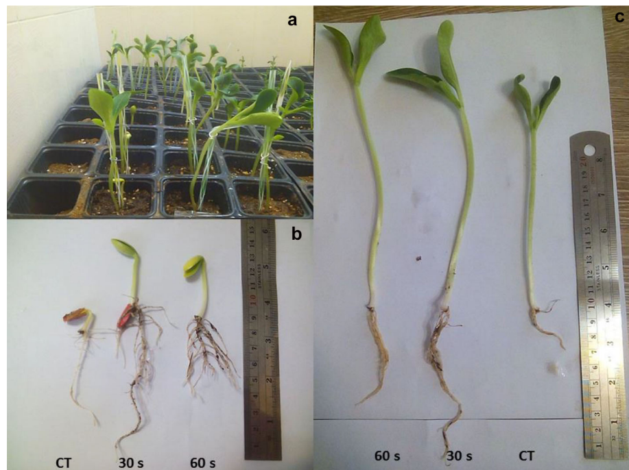
Fig. 4 Image of Zucchini seeds, a workplace, b after 7 days, and c after 14 days