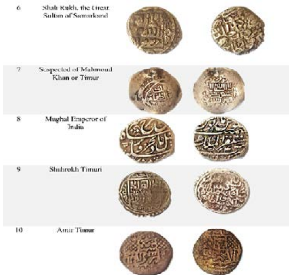
Table3. The initial results announced by the XRF device prepared by the authors.