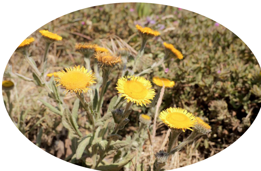
Fig. 1. The photograph from the aerial parts of Pulicaria gnaphalodes (Vent.) Boiss. growing wild in the sampling area (Sahraye Jalali, Shahrood, Semnan Province, Iran (36°24'48"N 54°58'41"E).

during the flowering period, while wearing polystyrene gloves, in Sahraye Jalali, Shahrood, Semnan Province, Iran, located at 36°24'48"N 54°58'41"E. The plant was first identified by a local botanist and a voucher specimen has been submitted to the Herbarium of the Research Institute of Forests and Rangelands in Tehran, Iran, for further verification (HRIFRT56q).