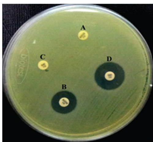
Figure 2. MBL screening by CDDT. (A) Meropenem disc (10 µg). (B) Meropenem disc (10 µg) + 10 µl EDTA. (C) Imipenem disc (10 µg). (D) Imipenem disc (10 µg) + 10 µl EDTA.

in curing these infections is created. The appearance and obtaining MBLs among gram negative bacteria, especially those bacteria that has an important role in creating clinical infections, are important at least due to 2 reasons. Regarding epidemiologic, relevancy and increase of MBLs not only causes the resistance against carbapenems, it also is followed by the resistance against a lot of beta-lactam and non-beta-lactam antibiotics (14,15).