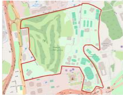
Figure 1. GIS map of the study area (Englab Sports Complex, Tehran)