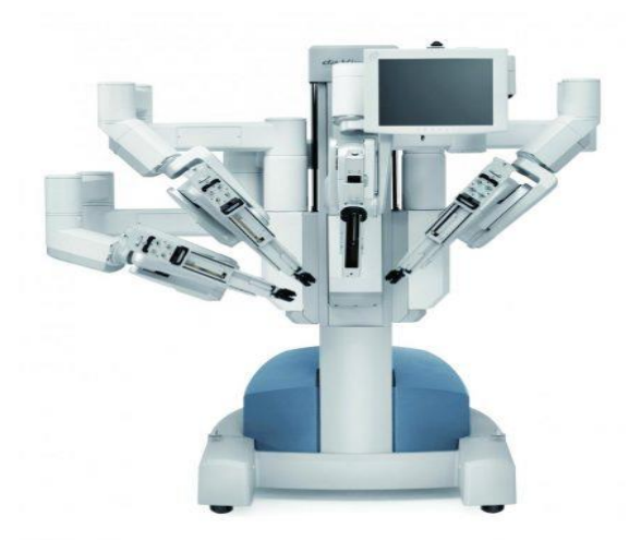
Fig. 2 Image of a multi-nozzle intelligent robot for surgery with multifunctional artificial hand

Fig. 1 shows the mechanism of intelligent robotic surgery, which used as artificial intelligence and biomechanics to easily perform remote surgery for patients in weak countries or patients with mobility problems. In this method, which is given special attention in the health and medical tourism industry, different types of robots with different degrees of freedom (DOF) can be used. In robotic surgeries, incisions may be made on the patient's body to perform the surgery more accurately. In other words, the robotic arms move in such a way that there is no vibration and therefore the incisions may be made in their exact place. However, when the surgery is performed by a physician, the surgeon's shaking hand when making an incision at the