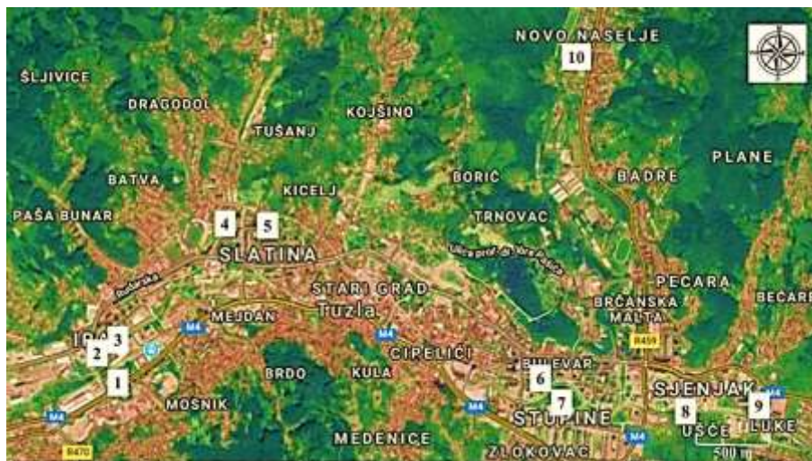
Figure 1. Locations of sampling sites in Tuzla city.

samples were taken. The locations of sampling sites are indicated in Figure 1. All samples were taken in summer 2018.