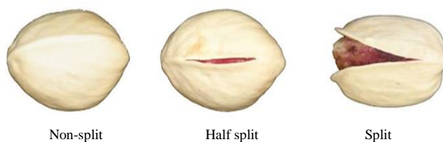
Fig. 1. Split, half split and non split pistachios.

After washing the nuts, the samples were divided to three categories: first category contained nuts with a longitudinal gap in their shell on both sides (splitting), second category contained nuts with gaps that were on one side of shell (half splitting) and the third category contained nuts with no gap in their shell (not splitting) (Fig. 1).