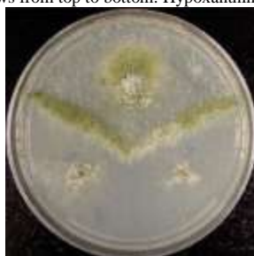
Fig. 3. The complementary reaction between A. flavus isolates by developing dense aerial mycelial growth and sporulation at the zone of hyphal contact.